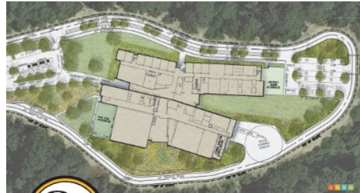
Renderings of the proposed new high school building and site plan.

The Commissioners recently awarded a competitive bid contract to Boney Construction, LLC, in the amount of $167,500.00, to rebuild a stormwater retention facility in Olde Sewickley Highlands. The funding of the project is entirely covered by a grant from the Gaming Economic Development Tourism Fund. The Township was awarded another grant from the Gaming Economic Development Tourism Fund for a project at Ambridge Ave Park. A contract in the amount of $243,160.00 was awarded to El Grande, LLC, for improvements there, including new refurbished sports courts, one for pickleball, as well as preparation for a Veterans Memorial. Youngblood Paving Company will be resurfacing some sections of Watson Street in Leet Acres sometime this summer. Residents will be notified when the project is ready to begin. The Township was awarded a Community Development Grant in the amount of $127,000.00 to continue the sidewalk replacement project in Fair Oaks.